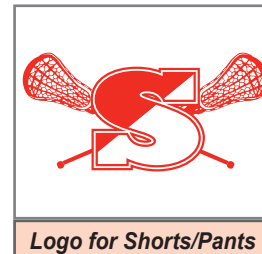
Logo for Shorts/Pants

TO ORDER YOUR QUALITY SABLA WARRIORS TEAM APPAREL: Enter quantity in boxes below. Screen-printed apparel has choice of personalization. Embroidered apparel has choice of logos (options shown above). Flex Fit Hats have "Warriors Lacrosse" on the side. Total the cost per line, and total each section. Items sized 2XL and 3XL require an additional charge. Add the two sections together to find your grand total for the order. DELIVERY: Items will be delivered to the field the first week of practice. ORDERS AND PAYMENT DUE: FEBRUARY 15, 2007.