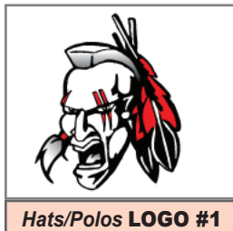
Hats/Polos LOGO #1

Download Order Form: www.theteamstore.net